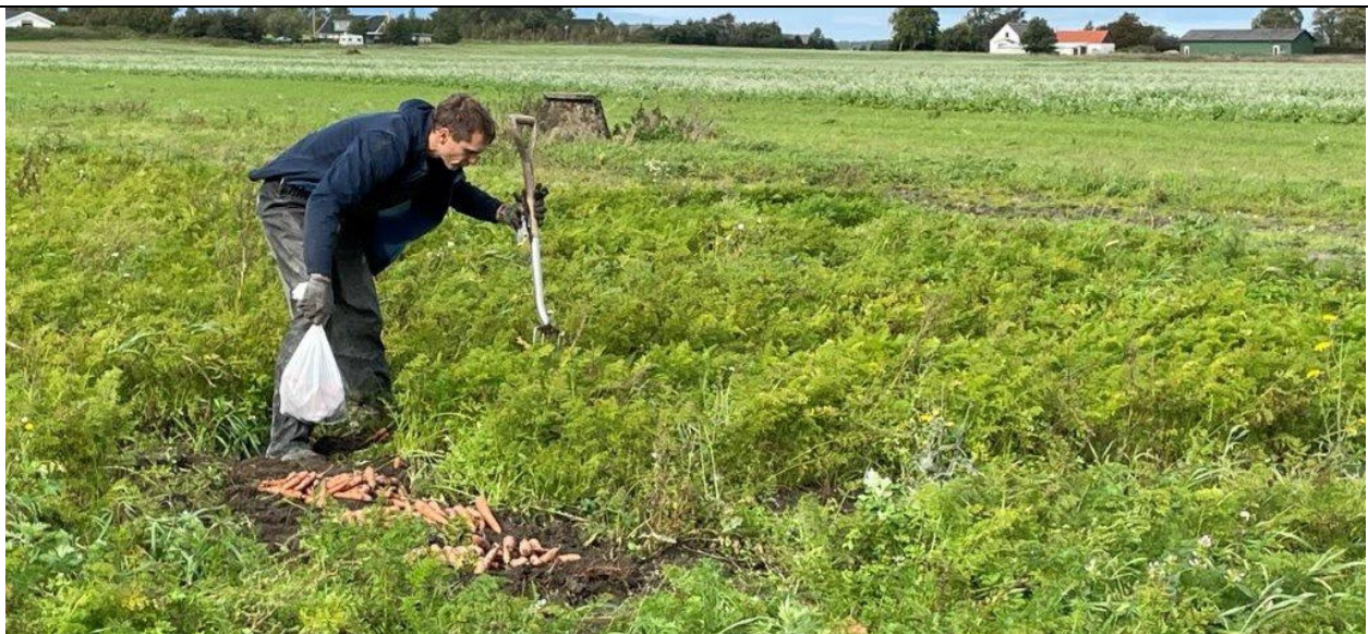
Demonstration and sampling day 10 th of October